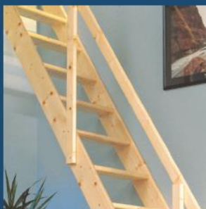
Space saving staircases