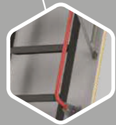
White insulated hatch and handrail