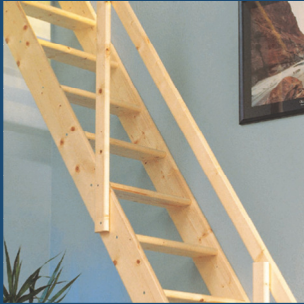
Space saving staircases